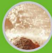
Extract pure and light of Tourmalin powder