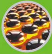
Under the 1350 high temperature to burn for 48 hours