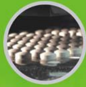
Select high-quality of Tourmalin powder to meticulously make production molding.