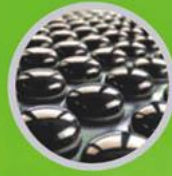
Make out the glossy Tourmalin after a special heat treatment and release far-infrared and negative ions.