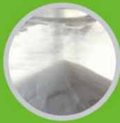
Extract high-quality parts to make powder granular.